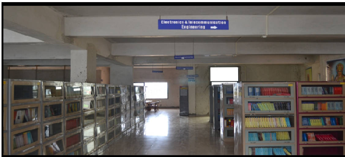
TEXT BOOK COLLECTION

The books are arranged in the shelves from 000.00 to 999.99 as per Dewey decimal classification from top to bottom towards right. The Engineering books are arranged in 620-629 including Civil Engineering, Computer Science and Engineering, Electronics and Telecommunication Engineering, Electrical Engineering and Mechanical Engineering.