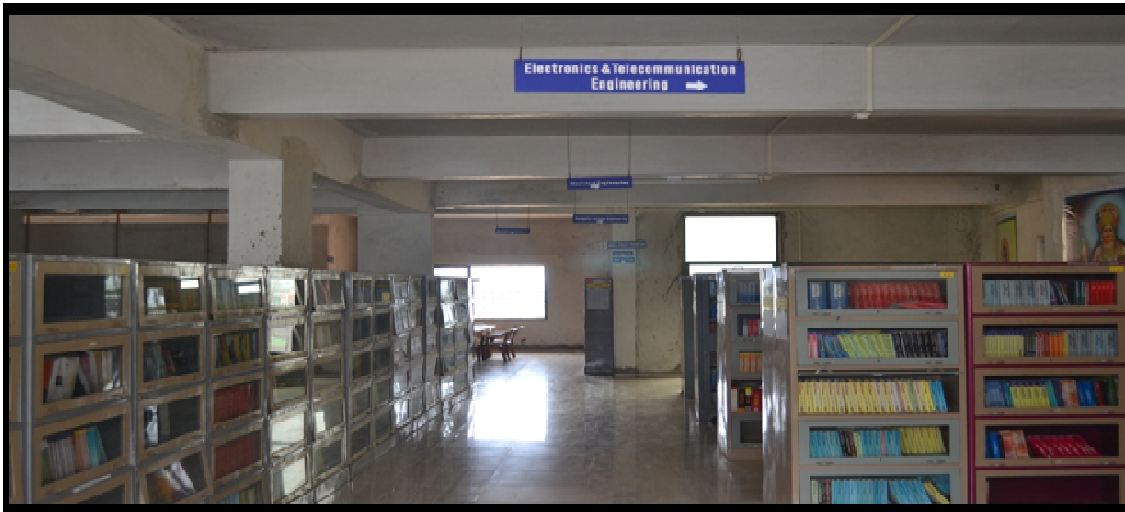
TEXT BOOK COLLECTION

The books are arranged in the shelves from 000.00 to 999.99 as per Dewey decimal classification from top to bottom towards right. The Engineering books are arranged in 620-629 including Civil Engineering, Computer Science and Engineering, Electronics and Telecommunication Engineering, Electrical Engineering and Mechanical Engineering.