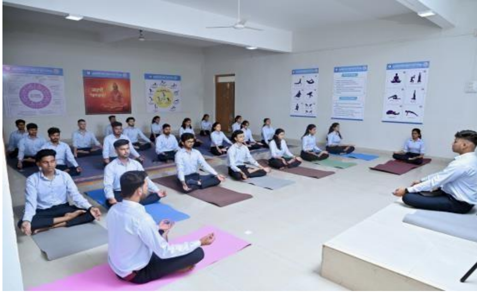
Yoga & Meditation Hall