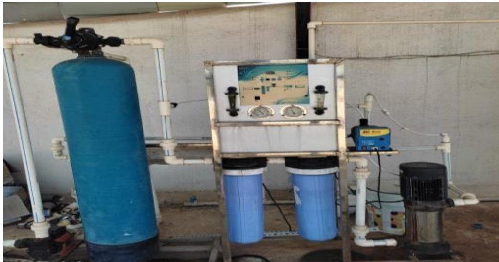
Water Purification Plant