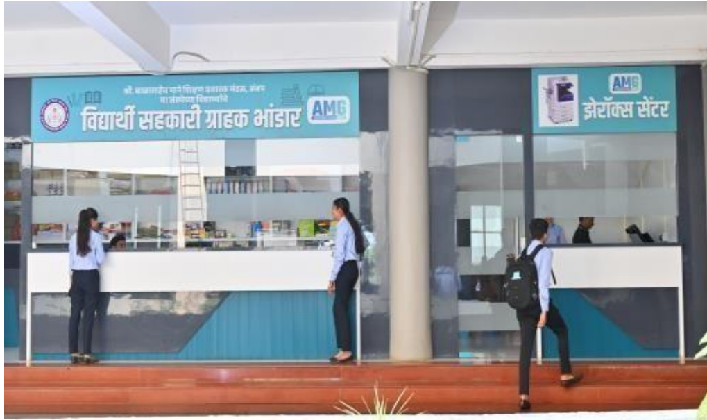
Vidhyarthi Grahak Bhandar